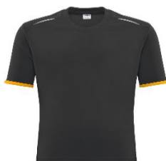
Round Neck T-shirt